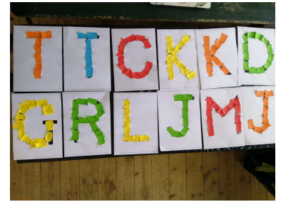
Some of the Northway Grade R learners' work

The team attended an exciting two-day virtual training workshop on the Western Cape Education Department Teaching for All Moodle course, which will be accessible to educators shortly. The course focuses on providing educators with skills to support inclusive education in their classrooms.